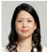
Mio Kashiwamura Staffing —Domestic Staffing