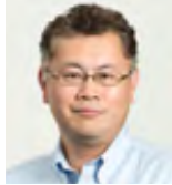
Toshio Oka Staffing —Overseas Staffing